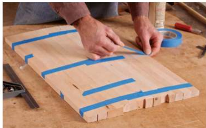
No clamps needed. Coleman glues the staves together with just a few small beads of glue and uses tape rather than clamps. This method leaves small gaps, which allows for fractional movement between the staves. He works quickly, assembling the panel in smaller sections by stretching the tape across the joints. Then he glues the subassemblies together.