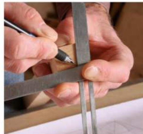
Each one gets a mark. Transfer the bevel angle to the end of the stave. Number the stave at this time to match the drawing.