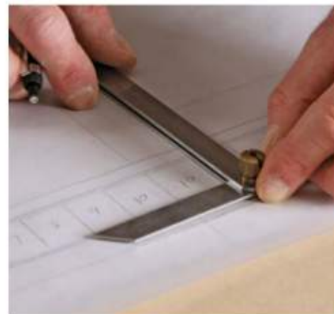
Get an angle on the staves. Set a bevel gauge to closely match the curve along the top of each stave.