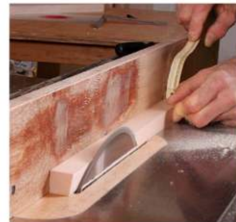
Remove the waste. After marking all the staves, get a head start on the shaping by beveling each one at the appropriate angle.