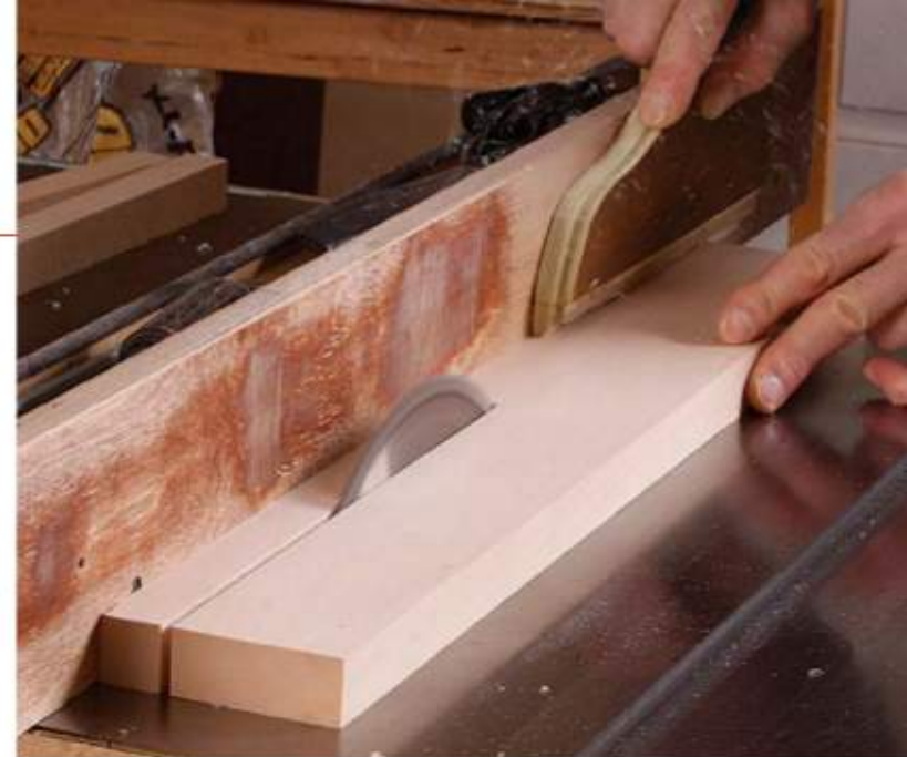
Rip 'em. After milling the stock to thickness, cut enough 1-in.-wide staves to make the door panel. Rip plenty of extra staves and discard any that are excessively bowed or twisted.