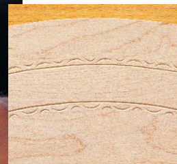
Filling in. With the grooves and the first stamp having established a framework, building the rest of the pattern is a matter of filling in.