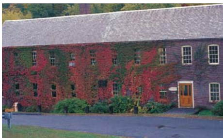
Windfall mill. The author stumbled upon a cache of steel stamps and a new way of decorating furniture when he rented space in this mill previously occupied by a stamp-making company.

There is a rich tradition in furniture making of creating decorative surfaces with marquetry, inlay, carving and patterned veneer. I use them all. But I have learned that each of these techniques demands a great deal of planning and precise work to achieve the desired effect.